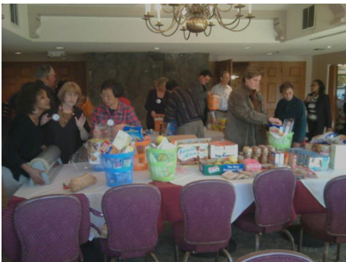
Our whole club got in the holiday spirit at our mid-November meeting, making 22 holiday baskets for the homeless and under-privileged, with 3 full bags of additional food given to the food pantry.